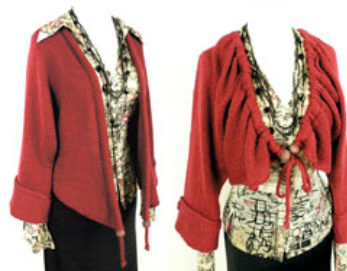
not-gathered gathered click to enlarge