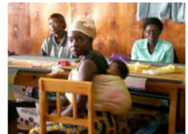
RWANDA: A mom with baby learning the USM at Women for

The knitters in Rwanda are so amazing. They've not only registered 28 knitting cooperatives, but have secured orders for school sweaters, have taught themselves design (check out the outfits on the Nyagatare knitters), are earning a living—and the smiles all prove it! Here are a few shots with more information on Rwanda Knits at www.rwandaknits.org .