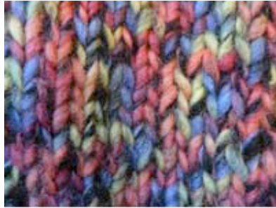
Here is the color Allspice before felting

would make an interesting felting test. Black Magic is composed of a solid black core with a multi-color, all wool roving wrapped around it, almost like a ply but much softer. If the wool felted (shrunk) around the acrylic, what would the result be?