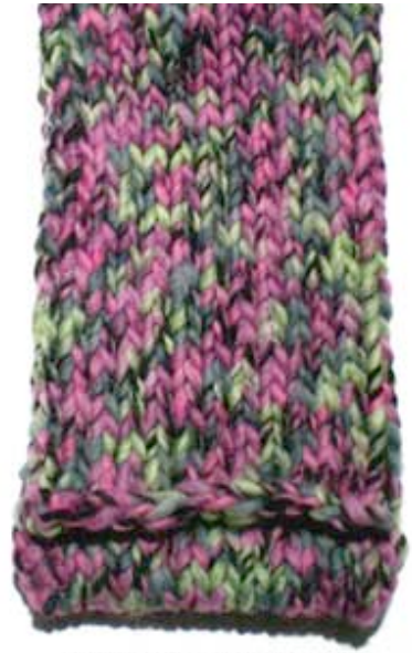
Here's what the purse looks like before felting.